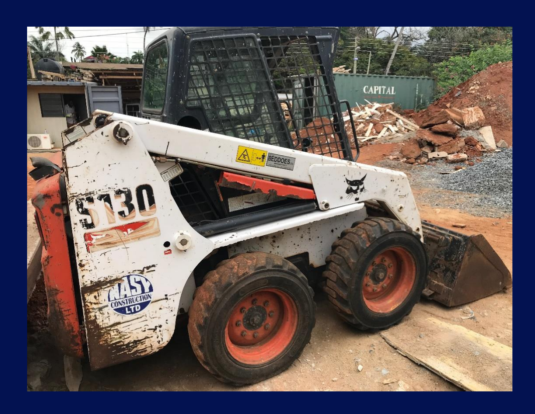
BOBCAT S130 SKID LOADER