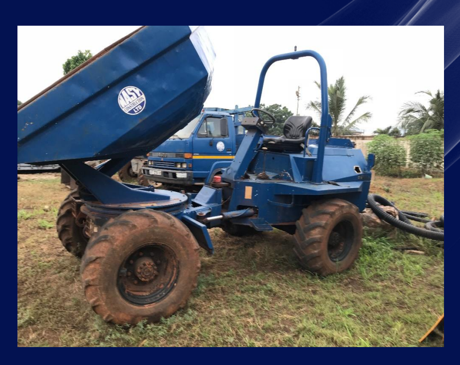
6 TON TEREX BENFORD SITE DUMPER