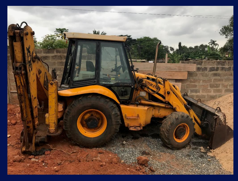
JCB 3CX BACKHOE LOADER