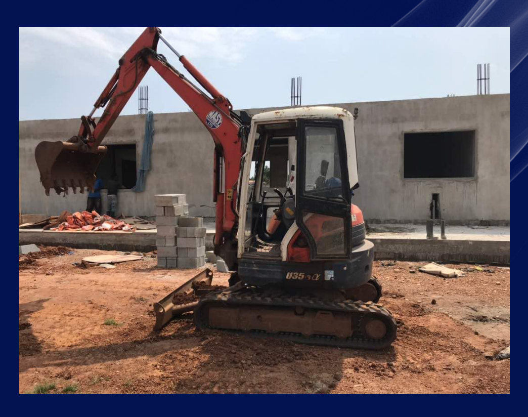
KUBOTA 3TON EXCAVATOR